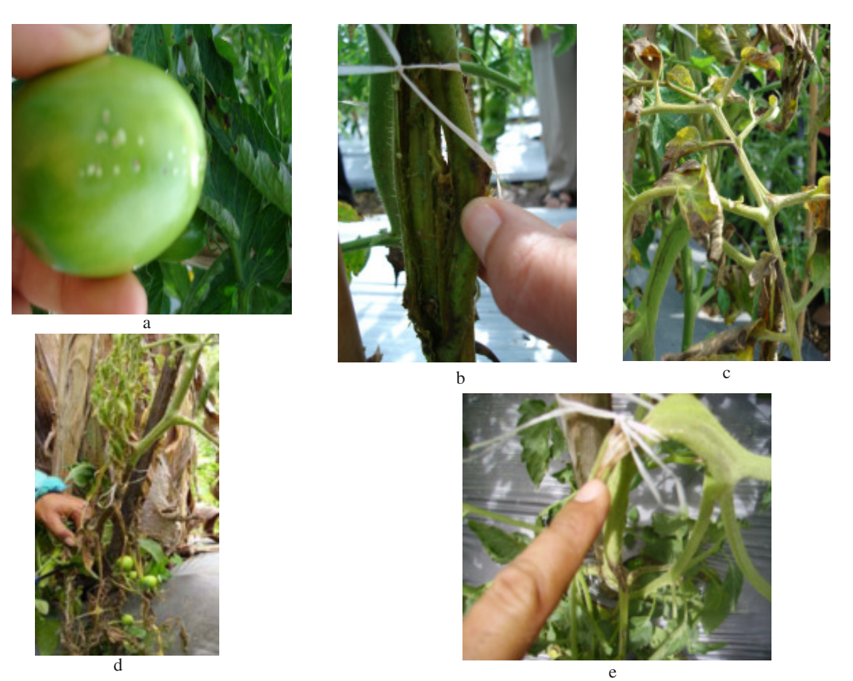
Fig 1 Examples of tomato showing typical symptoms of suspected Clavibacter michiganensis subsp. michiganensis infection observed in the field. a, tomato fruit showing bird's eye spot symptoms (arrow) from Danau Kembar, Solok, West Sumatera and tomato plants showing; b, split stem secretion and showing pith discoloration (arrow) from Lembah Gumanti, Solok, West Sumatera; c, wilting leaves and necrosis at the leaf perimeters from Matus, Kediri, East Java; d, blackened stem, wilting leaves and necrosis at the leaf perimeters from Wanayasa, Banjarnegara, Central Java; and e, stem necrosis (tissue discoloration) from Cipanas, Cianjur, West Java.